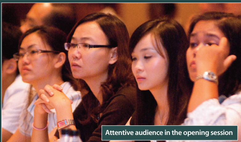
Attentive audience in the opening session

Ask for details of our special registration rates for groups.