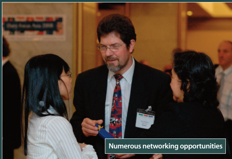
Numerous networking opportunities