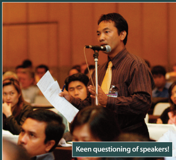
Keen questioning of speakers!